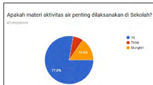
Fig 2. Teacher's response

The number of teacher respondents in this study was 45 who actively taught in the School.