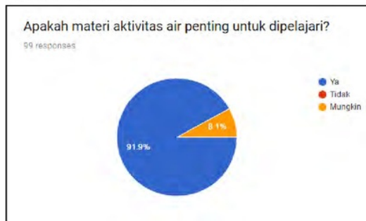
Fig 1. Student responses

The number of respondents who filled this instrument was 99 people. Participants who were chosen to respond were participants who had attended school or students who were attending school who had received Physical, Sports and Health Education subjects.